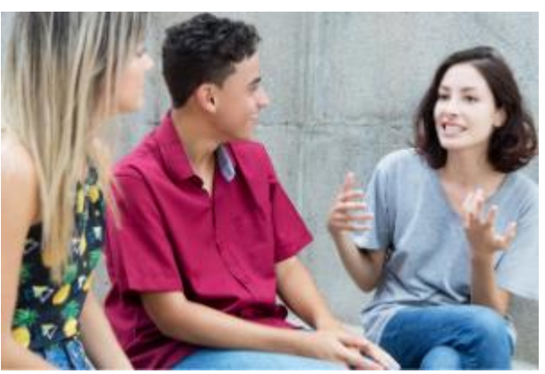
Programme activities and outcomes The programme will develop and create three practical resources for youth and entrepreneurship organisations.